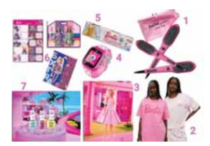
1 Dafni Power brush limited edition with a thermal bag | Photo by PR 2 H&M photo Hennes and Mauritz 3 Barbie doll | Courtesy of Mattel 4 Kidi Watch | Photo by Liran Tal 5 CTC Tooth paste | Photo by PR 6 Back to school at Kravitz | Photo by PR 7. OPI limited edition | Photo by PR

the fashionable doll that has a big dream house, a well-kept garden, and a red Corvette, wonders what's wrong with a small plastic figure that comes in all skin colors, has a myriad of professions, and gives hope to every girl in the world that there is no limit to what she can achieve if she wants to.