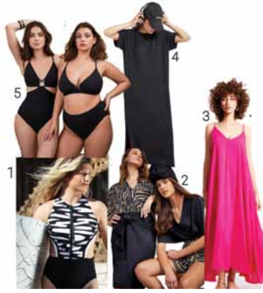
1 Free Sport By Gottex | Photo by Malka Nihom 2 Modest By Gottex | Photo by Amir Yahel 3 Beach Life Resort By Gottex | Photo by Amir Yahel 4 Airport By Gottex | Photo by Amir Yahel 5 Turkiz By Gottex | Photo by Amir Yahel

Gottex Modest swimsuits, skirts, tights and modest headgear is designed for the religious sector or anyone who prefers modest cuts. Pilpel is a collection that combines a young and sexy look with comfort and support, in a low price