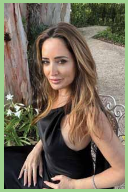
On the cover: Pola Blick | Photo courtesy

CEO Jerusalem Post Group INBAR ASHKENAZI