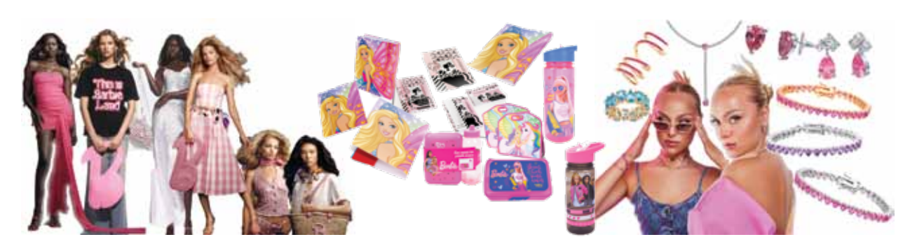
Capsule collection at ZARA

Barbie continues her journey to represent global diversity with a variety of dolls of all types and colors, which includes over 175 dolls of every skin tone, eye color, hair color, and body structure.