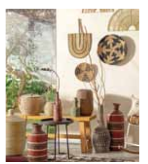
Golf × Kuchinate