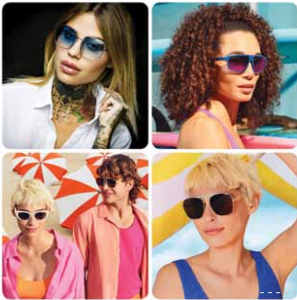
OPTICA HALPERIN CHAIN

B ig or small, square or round, sunglasses have long been a fashion trend. A look at this summer's collections proves that many trends have become classics. It is difficult to point to one outstanding trend, so you can choose a rectangular, sporty, cat or classic frame and still be in style. These are some of the leading trends: