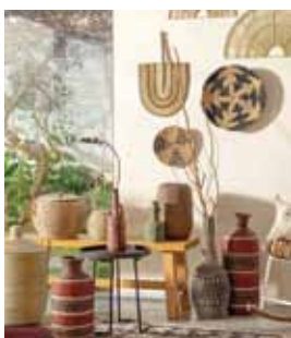
Golf x Kuchinate

In accordance with the clients' taste and personal preferences, Arena crafts pieces of furniture that ideally suit their home, and at prices they can afford. Arena is currently launching a furniture collection that features a variety of designs and trends straight from the design exhibition in Milan, offering Israeli consumers the opportunity to furnish or refurbish their home in a contemporary international style. •