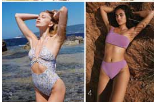
1 Gottex | Photo by Alex Lipkin 2 Luma By Gottex | Photo by Dor Sharon 3 Flirt By Gottex | Photo by Dor Sharon 4 Au Naturel By Gottex | Photo by Dor Sharon

range. Free Sport is a collection that includes special features for maximum support and comfort during water sports. The Gottex Men swimwear collection comes in a variety of unique prints. Pilpel Kids are one-piece or two-piece