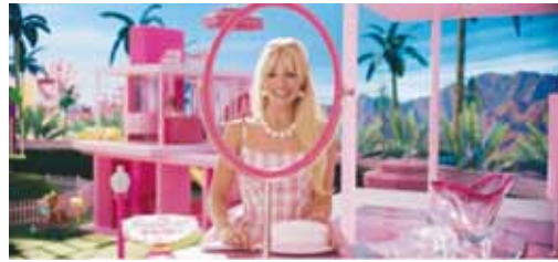
Barbie the movie | Photo by Tulip Entertainment

Barbie's detractors contend that she symbolizes a negative aspect of consumer culture and has an unrealistic female figure. But Handler, who created