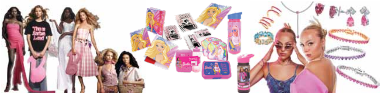
Capsule collection at ZARA

Barbie continues her journey to represent global diversity with a variety of dolls of all types and colors, which includes over 175 dolls of every skin tone, eye color, hair color, and body structure.