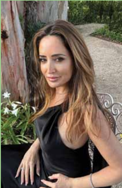
On the cover: Pola Blick | Photo courtesy

CEO Jerusalem Post Group INBAR ASHKENAZI