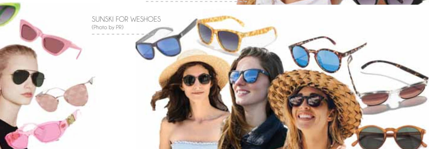
SUNSKI FOR WESHOES