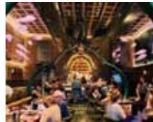
Minna Tomei

The Asian restaurant chain Minna Tomei, one of the leaders in the genre, continues to expand, opening a restaurant in the BIG center in Yehud and the Ono Valley area.