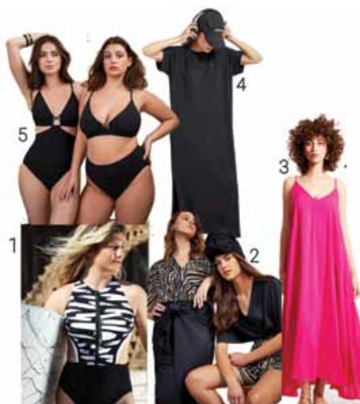
1 Free Sport By Gottex | Photo by Malka Nihom 2 Modest By Gottex | Photo by Amir Yahel 3 Beach Life Resort By Gottex | Photo by Amir Yahel 4 Airport By Gottex | Photo by Amir Yahel 5 Turkiz By Gottex | Photo by Amir Yahel

Gottex Modest swimsuits, skirts, tights and modest headgear is designed for the religious sector or anyone who prefers modest cuts. Pilpel is a collection that combines a young and sexy look with comfort and support, in a low price