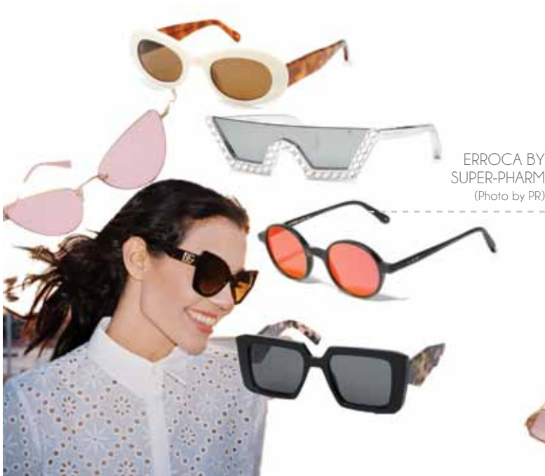
ERROCA BY SUPER-PHARM

The professional sports frames have become a leading trend in recent years. Maybe it's due to the sportswear that has taken over the wardrobe or perhaps the futuristic look of the glasses, whose lenses have high-level sun filters.